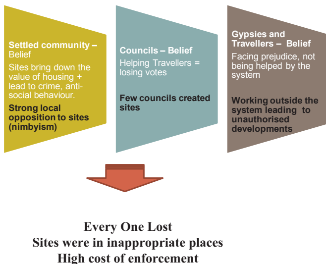
Diagram 2 – How Commonly Held Beliefs stalled Site Provision Post Circular 1/94 and Contributed to Community Tensions